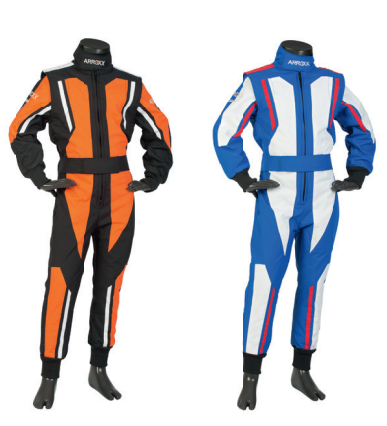
Color: Black-Orange-WhiteColor: Blue-White-RedProd no 54478Prod no 54480