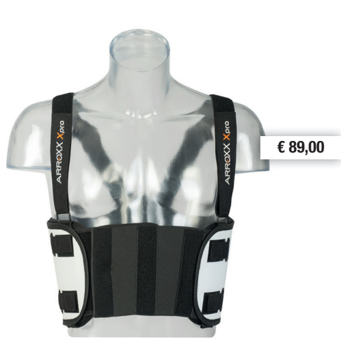
Color: Black-White Prod no 54523